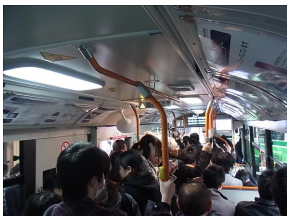
Figure6: Monitor passengers in full-capacity on a verification test drive