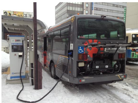
Figure5: Verification test in winter