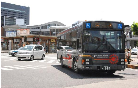
Figure3: Verification test at Akita Station