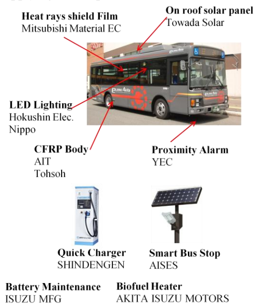
Figure1: Participants and their technologies implemented

as; rapid battery charger, battery mounting/dismounting handcart, and self-power supplying bus stop, etc.